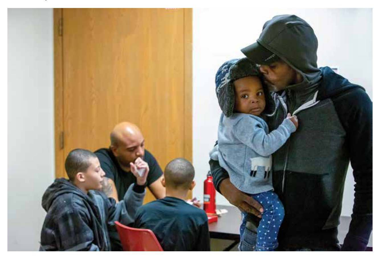
A visit day at Primo Center