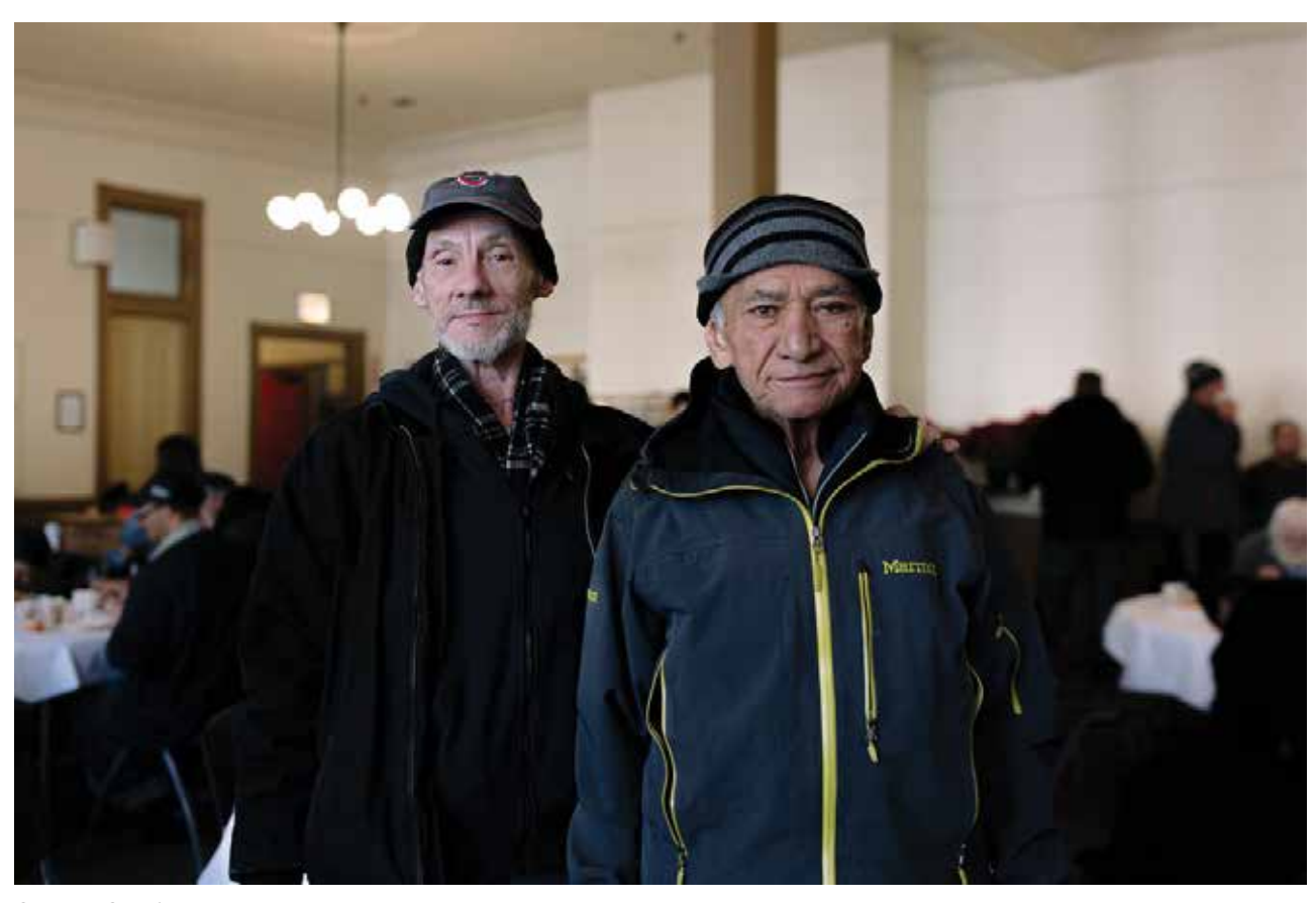
Guests at Care for Friends